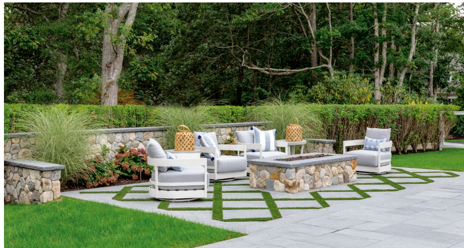
Adjacent to the pool house, a guest house was built on top of the garage and offers ample space to entertain. All outdoor gathering spaces are neatly nestled in lush layers of flourishing landscape by Coy's Brook Landscaping.

The seamless transition between the indoors and outdoors is highlighted by a cohesive color palette that unifies the main gathering areas.